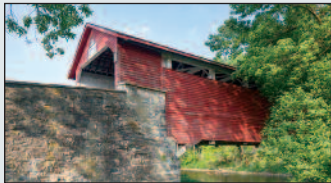
Manasses Guth's Bridge